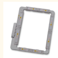
7" x 12" MAGNETIC FRAME SAMF300