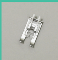
N+ MONOGRAMMING FOOT SA216