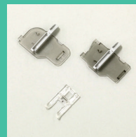
SPANISH HEMSTITCH FOOT SA220