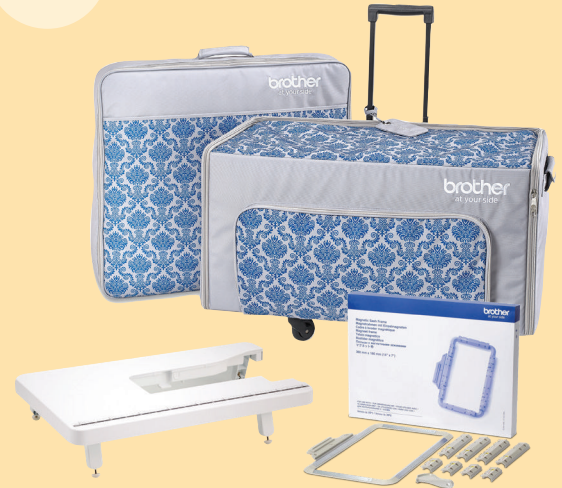
WIDE TABLE SAWTXP1C