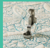
HIGH SHANK RULER FOOT SA218