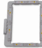
7" x 12" MAGNETIC FRAME SAMF300