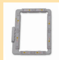
7" x 12" MAGNETIC FRAME SAMF300