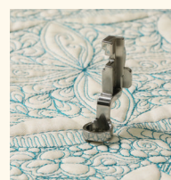
HIGH SHANK RULER FOOT SA218