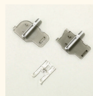
SPANISH HEMSTITCH FOOT SA220